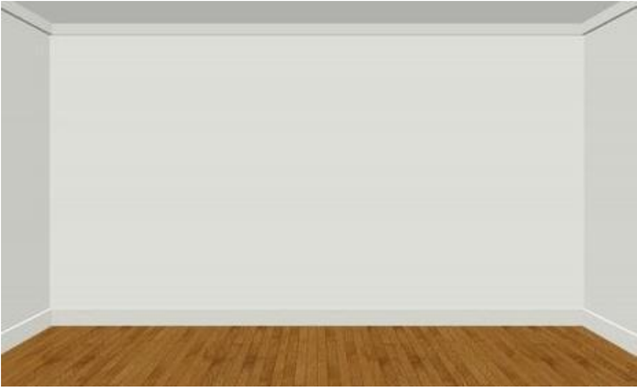
Wallpaper design (See attachments for A3 template.)